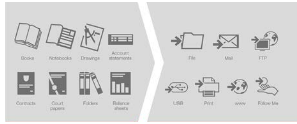
Output of zeta files in a variety of different ways.

The company is the global market leader in book scanners used in libraries and archives. With zeta Office, Zeutschel is launching the overhead scan into the office environment for the first time. The company founded in 1961, employs 65 members of staff and its products and services are represented in more than 100 countries. Like all other Zeutschel products, the zeta office is ,Made in Germany': The complete manufacture and entire research and development activities take place at the company's headquarters in Tübingen.